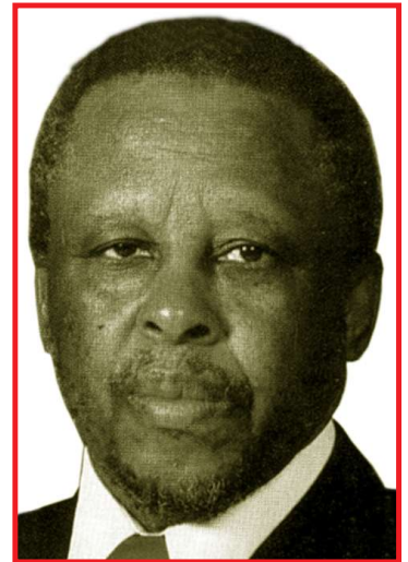
Festus G. Mogae (1998 - current)